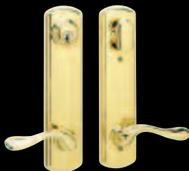
Contempo Solid Brass only

Ask for the Exclusive W&F Solid Bronze Hardware Catalog: